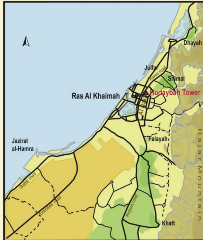
Location of Hodaybah Tower