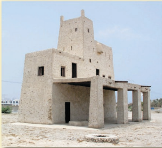
The tower from the north

The lush and fertile palm gardens of Nakheel have always been an important source of food and water. Many people lived inside these shady oasis and more came during the summertime, to escape the harsh heat and humidity. They lived in mud brick buildings and palm frond huts ("Areesh"), but rarely in stone houses, which were only built by local Sheikh families.