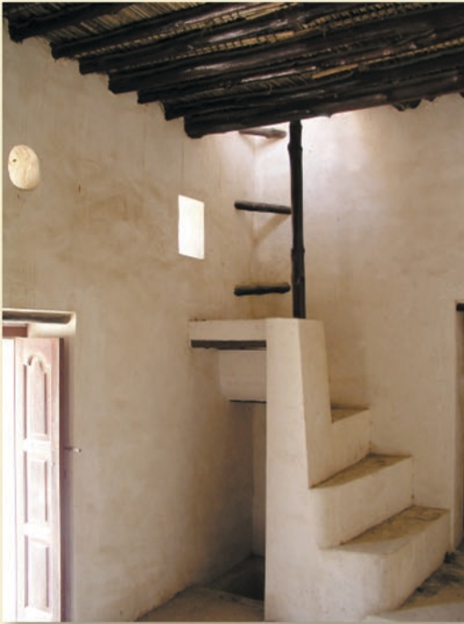
Access to the roof from the majlis